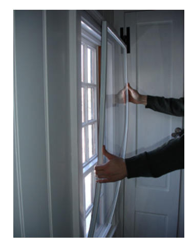
Interior storm panel.

Several retrofit measures perform as well as new replacement windows. Specifically, interior window panels, exterior storm windows and cellular blinds essentially match the energy savings of new, efficient replacement windows. (See energy savings comparison chart on Page 3.)